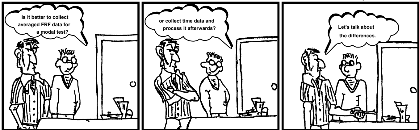
Illustration by Mike Avitabile

Is it better to collect averaged FRF data for a modal test? Or collect time data and process it afterwards? Let's talk about the differences.