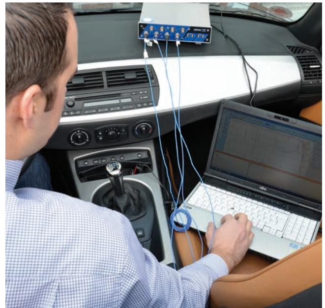
m+p VibPilot. Small in size. Huge in performance.

without influencing their excellent measurement performance. This allows you to use additional channels (e.g. 2 x 8 input channels) or to combine vibration tests and dynamic signal acquisition applications with ease. m+p Analyzer for noise and vibration analysis supports up to six m+p VibPilot devices with a total of 48 input channels.