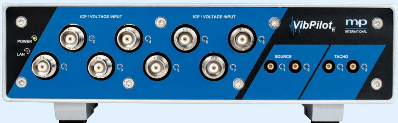
8-channel m+p VibPilot