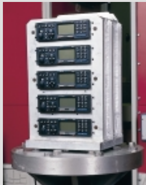
Car radio testing at Blaupunkt Werke GmbH, Hildesheim

Setting a new standard for affordable performance into the next millennium, VibPilot is the latest member of our VibControl family. VibPilot is precise and compact DSP instrumentation made by OROS combined with our established VibControl software using native Windows NT™/2000™. VibControl software has the same look and feel across the entire range of m+p vibration control systems, starting from VibPilot to the 128-channel high-performance VXI system.