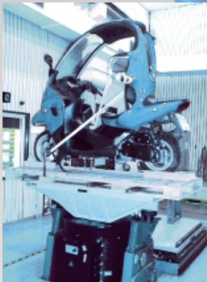
Institute for Quality Engineering, Testing & Approvals Environmental Test Engineering Siemens AG, Munich

Vibration Control and Analysis Solution ... Windows NT™/2000™ compatible ... precise, compact and affordable measurement hardware by OROS